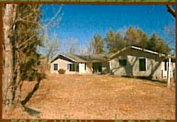
rear view - house